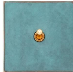
Lagon ( Lagoon )