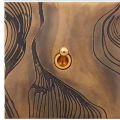
Méandres ( Meanders )

Estelle Matczak and Meljac are also able to pool their know-how to produce bespoke models for specific projects, with custom colours, patterns, textures and engravings.