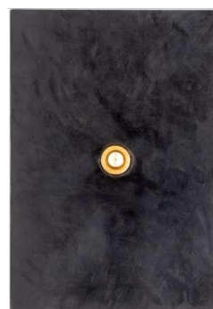
Noir Martelé ( Hammered Black )