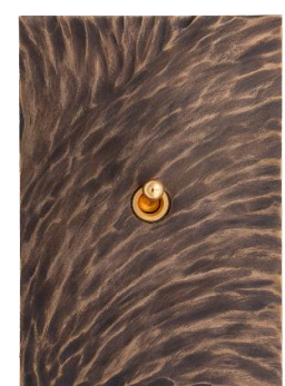
Plumes ( Feather )