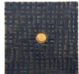
Tissage ( Weave )